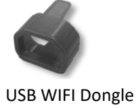
USB WIFI Dongle